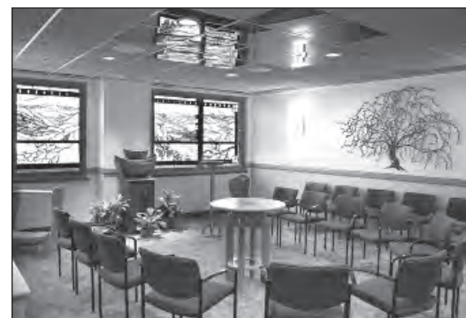
A newly renovated Interfaith Chapel opened on the Memorial Campus, designed to provide a place of peace, renewal, comfort and healing to patients, families and visitors.

served by the hospital. The hospital's $22.6 million expansion and renovation project opened in December 2007.